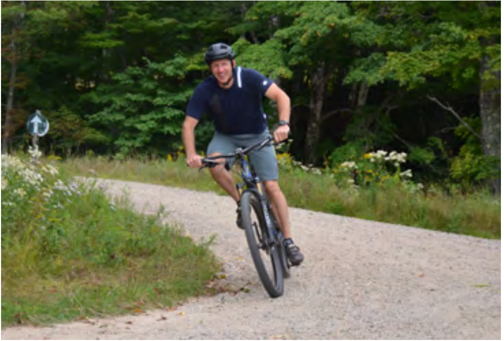
Mountain biking at Great Glen Trails Outdoor Center.